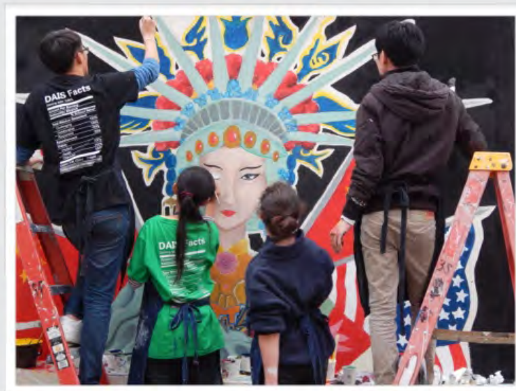
Magnificent DAIS Artists!

As we continue our Standards Based Education work through the year, I will continue to give you updates as to our progress. And, I hope you, too, will enjoy the beautiful and detailed DAIS visual display of US-China Friendship.